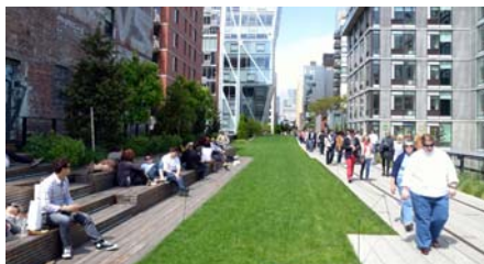
The section 2 with another 800 m of length contains also a lawn which can be used for sunbathing.