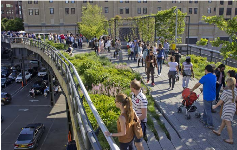
More than 20 million people have visited the High Line Park so far.