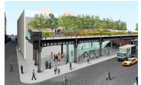
Today's appearance very much resembles this project outline (2003).