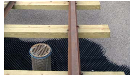
Installation of the green roof build-up under the rails. The drainage layer consists of infilled Floradrain® elements.