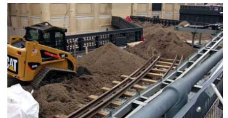
The average substrate depth is 450 mm.