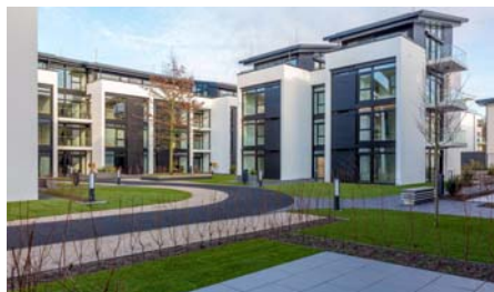
The main paved trail crosses the entire roof surface.