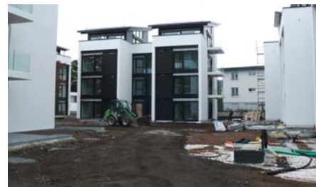
The system substrate "Roof Garden" was distributed on the roof by means of a wheel loader.