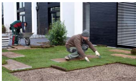
The turf rolls are applied densely over the system substrate.