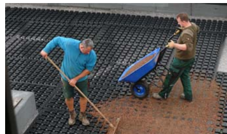
In order to make the drainage element more stable, it is filled with Zincolit® Plus, a high-quality recycled product based on specially treated clay bricks.