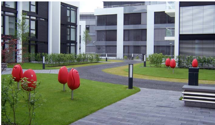
Tulip shaped seats invite to linger in the roof garden above the garage.