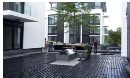
The Floradrain® FD 60 boards are laid loosely with some 30 mm of overlap along the edges.