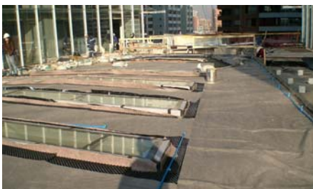
The irrigation pipes are installed above the filter sheet, the entire surface beneath is covered with Floradrain® elements.