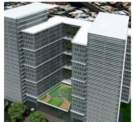
The first building of the new district "Nueva Las Condes" in Santiago de Chile provided with a green roof.

Palabra". This "Place of the Word" again forms the central point of the "Gran Boulevard Peatonal", a large pedestrian zone, which extends between the other buildings under construction. The generously ornamentally designed green roof is located on a lower connecting building and is therefore clearly visible from the office towers.