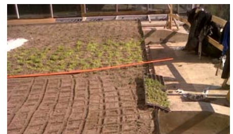
The plants are applied according to the design plan.